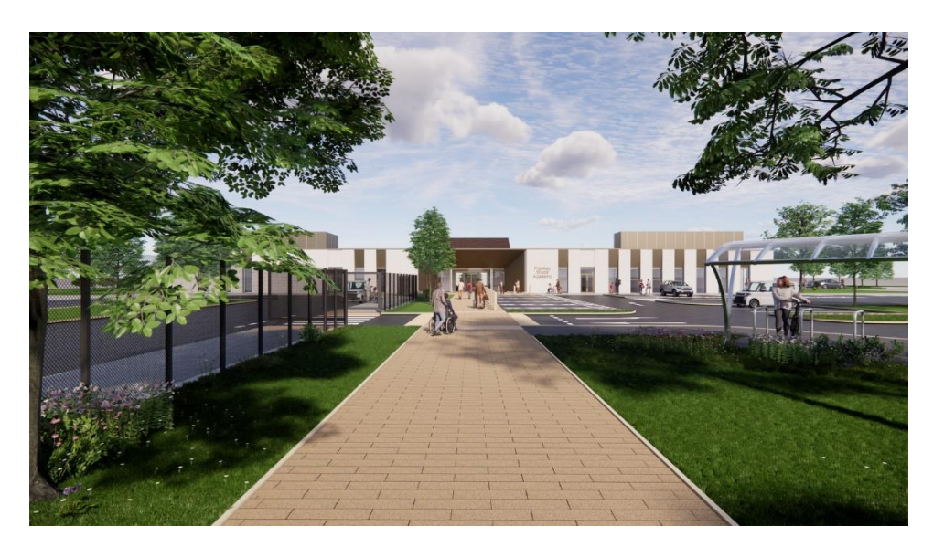
Appendix F: Prestley Wood Academy – Policies links on Horizons Education Trust website.